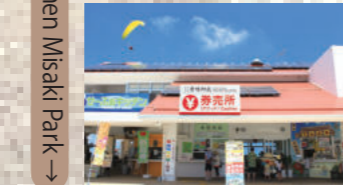
Parking Lot / Ticket Office