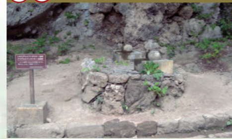
The two jugs are placed to collect the "holy water" dripping from the two stalactites above.