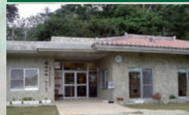
Midori no Yakata Sefa