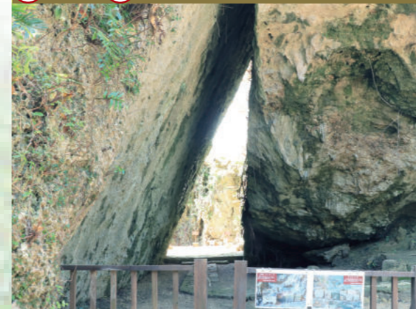
The innermost part of two stalactites and the enclosed triangular space are each places of worship.

※The altar of "Sangui" is also a "sanctuary" like the altar of "Ufugui" and "Yuinchi". It will be an off-limits area for environmental conservation and appropriate maintenance and management.