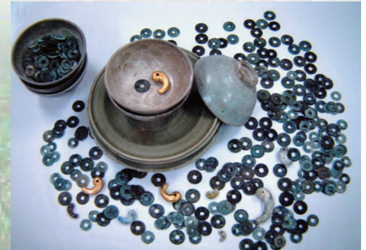
Sefa-utaki Excavated Items (National Important Cultural Properties)

Various items, mainly from the Middle Ages to Early modern times, have been excavated from the Sefa-utaki. Among them, jewelry items including gold, Chinese celadon porcelain and ancient currency in particular drew much interest. Items excavated from the extremely noble places within Sefa-utaki provide extremely valuable materials in the studies of the Ryukyu religious faith of that period.