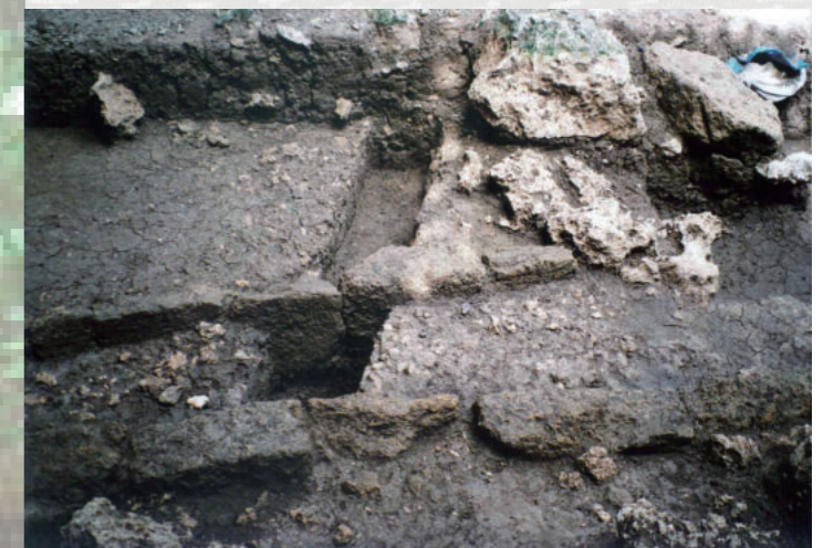
Drainage ditch of Sangui confirmed by excavations

A variety of remains were discovered from the excavations, such as drainage ditch that is running under the stone pavements of the approach and deposition of white sand used to cleanse the places of worship. Also, it has been discovered how the preparations for important rituals were made.